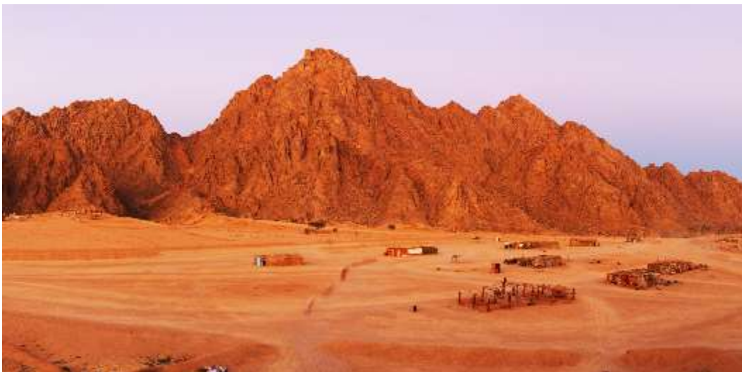
God revealed to Moses his eternal Name, Yahweh, translated in English as the LORD.