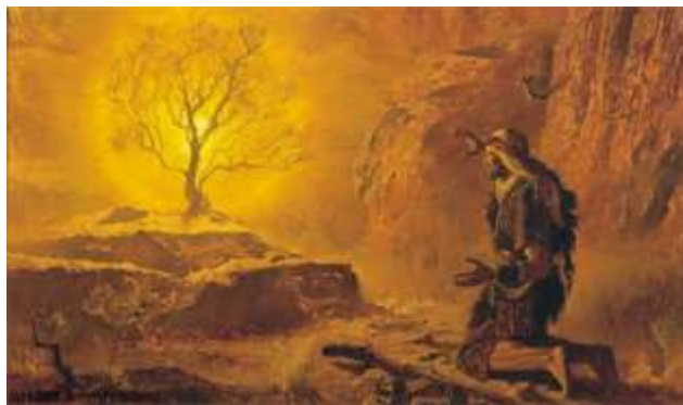
God spoke to Moses through a burning tree, commissioning him to return to Egypt.