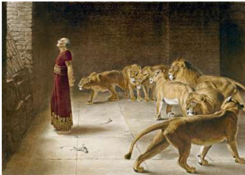
God kept Daniel safe in a den of lions.

God heard Daniel's prayer and saved him from being eaten by hungry lions.