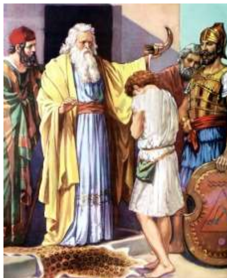
Samuel anoints young David who will one day become king of Israel.