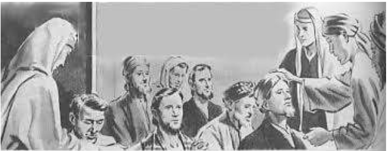
Apostles name elders or overseers in new churches.