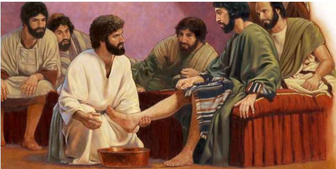
Jesus washes his disciples’ feet