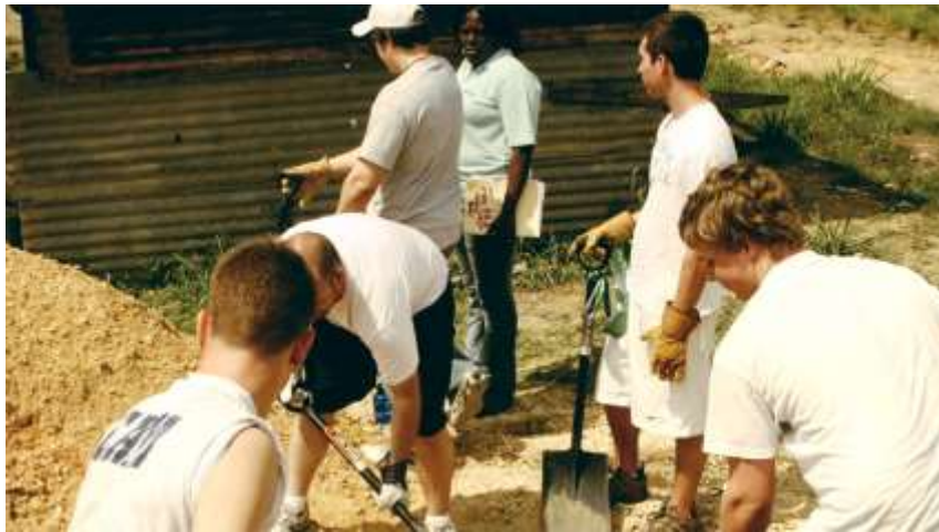
Serving one another in love

Some congregations' small groups meet at different times during the week, so that all can find a time to participate. Others have one long meeting once a week. In this case, they should include time for tiny groups to meet. During the main worship time, believers should give testimonies of how they came to know Christ, report healing, and relate other things of interest to the congregation.