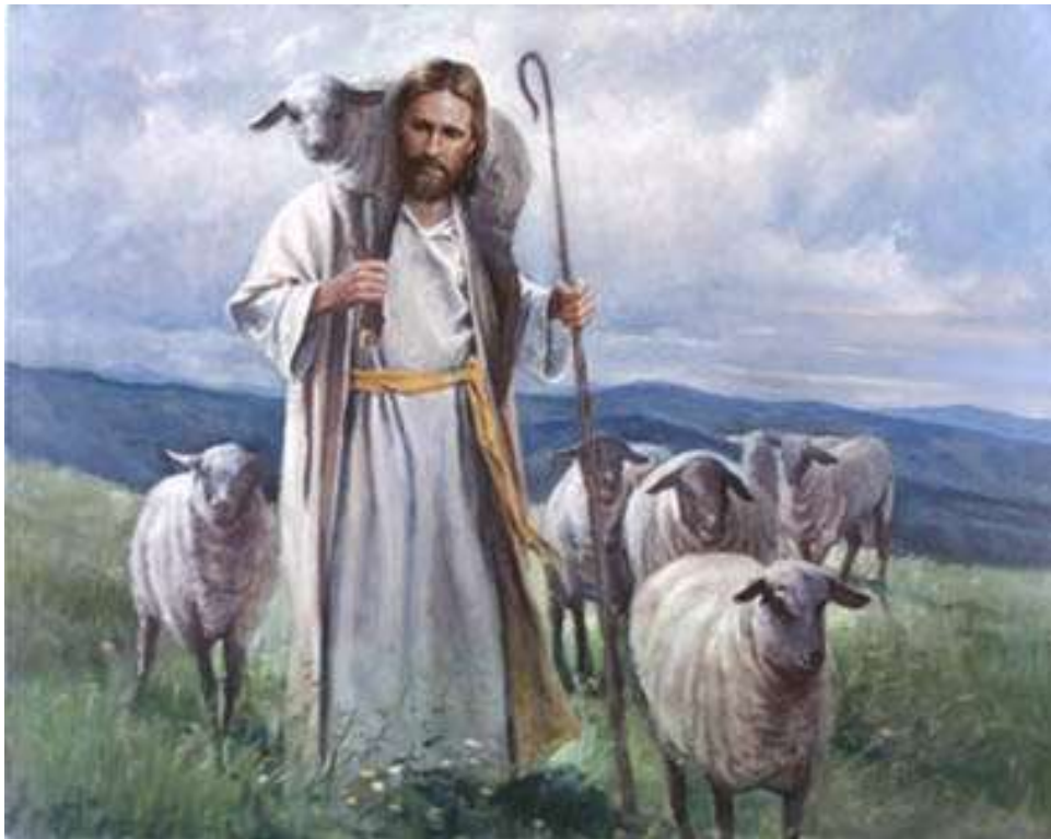
A good shepherd tends his flock and cares for each sheep.