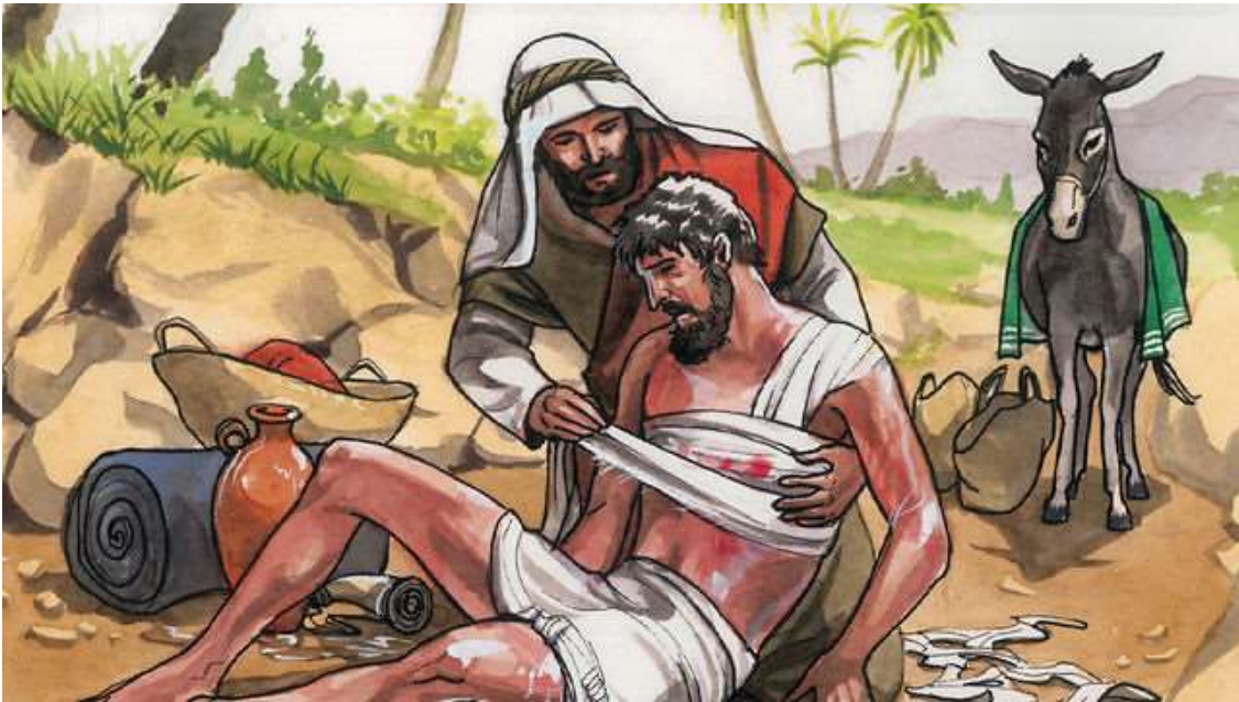
Robbers had beat a traveler and had left him to die.