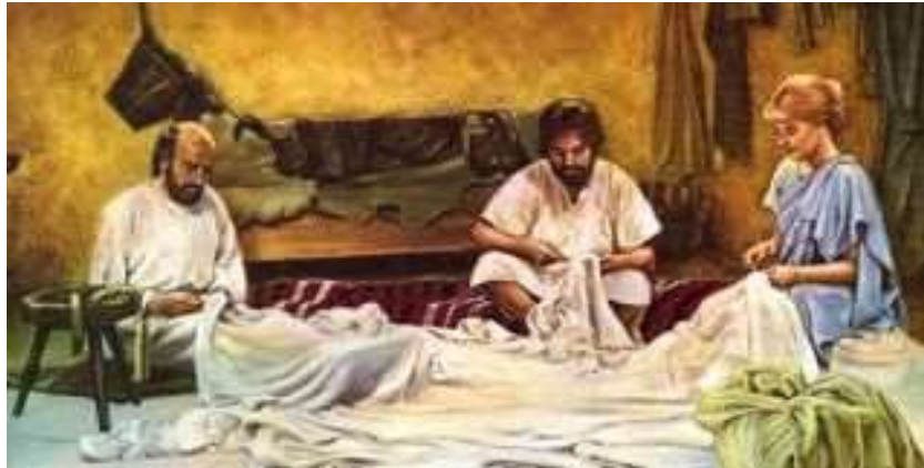
Paul worked as a tent-maker with Aquila and Priscilla, whilst planting a new church at Corinth.

How did Paul know that God was blessing his ministry? ( 9–10 )