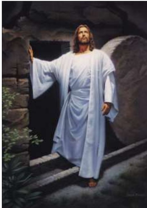
Third day after he died, Jesus came back to life and left his burial tomb.

Choose any or all of these children's activities.