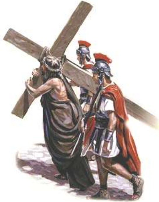
Jesus suffered and died as a sacrifice for our sins.