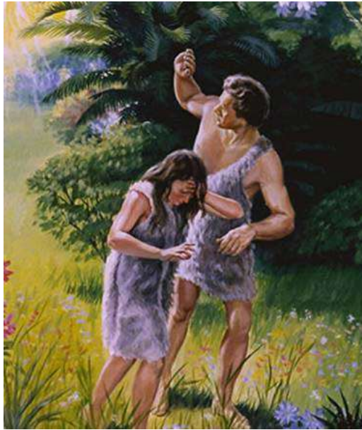
God banished Adam and Eve from his garden.

Find in Psalm 51:1–5 what King David said about his sin: