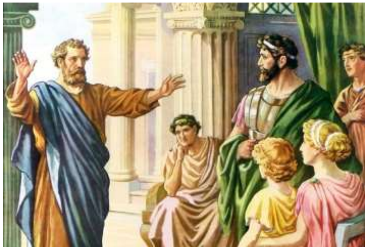
When Peter told the Good News about Jesus, all who were listening to him received the Holy Spirit.