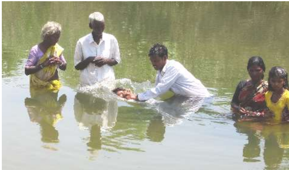
Scripture tells unbelievers to repent and to be baptized.