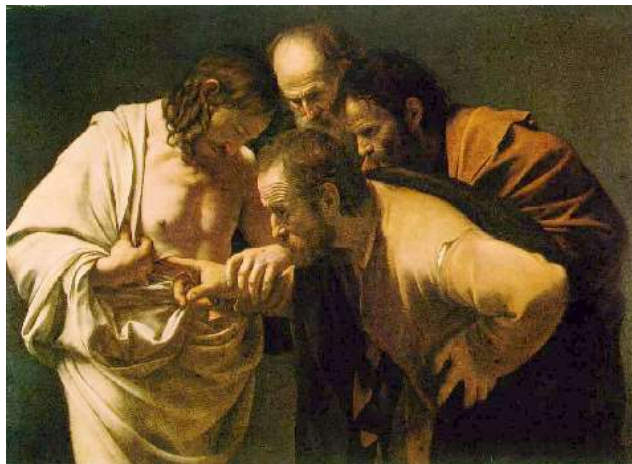
Eyewitnesses who know Jesus saw him after he return from death to life.