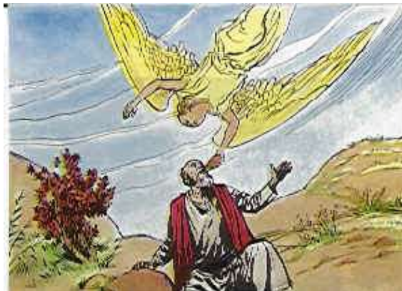
Isaiah was a prophet who saw into heaven, when an angel touched his lips.