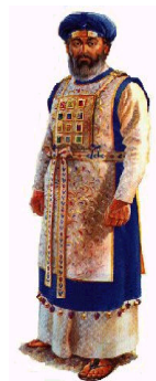
Jewish high priest