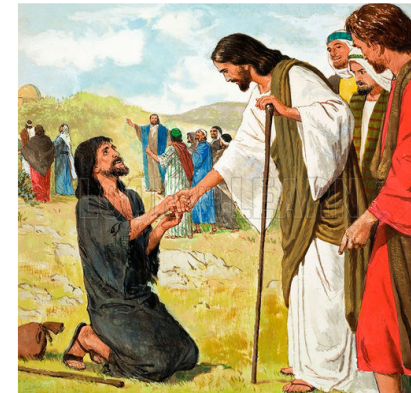
Jesus healed ten lepers. Only one of them returned to thank him.

Read the account about the ten lepers from Luke 17:1–9 .