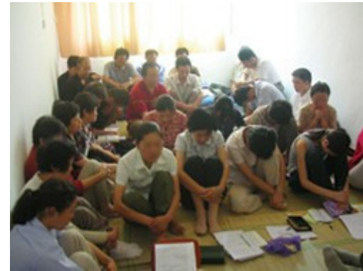
Missionaries prepare to go to neglected peoples

Those who teach children should read study #77 for children.