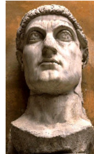
Statue of Constantine

By the year AD 300, there were so many Christians in the Empire, that the Roman government decided to stop persecuting them. Emperor Constantine issued his Edict of Toleration, making Christianity a legal religion. This had bad effects on Christianity: