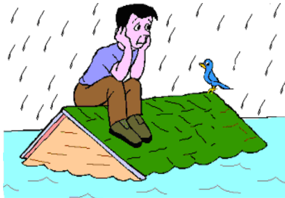
A man who built his house on sand