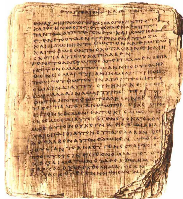
A very ancient copy of New Testament letters

The Apostles Wrote Letters to Instruct Congregations and Leaders