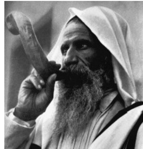
Blowing a ram's horn is an ancient call to worship.