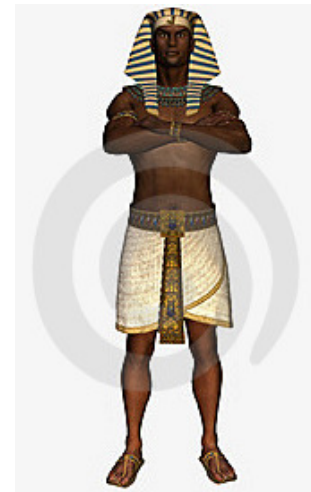
Image of an Egyptian Pharaoh

[Answer: Joseph was one of the original "children of Israel (Jacob)" who rejected Him out of envy. His father loved him greatly. He was obedient. His own people sold him (like Judas sold Jesus). He was taken to Egypt. He was falsely accused and put in prison. He rose to a position of power at the right hand of the king. In that position of power, he saved his brothers who had rejected Him. He revealed Himself in a glorious way at a great banquet.]